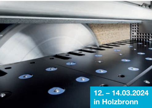
12. – 14.03.2024 in Holzbronn

Immerse yourself in the latest machine technology, complemented by innovative digital solutions designed to make your day-to-day work easier and more efficient.