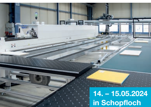
14. – 15.05.2024 in Schopfloch