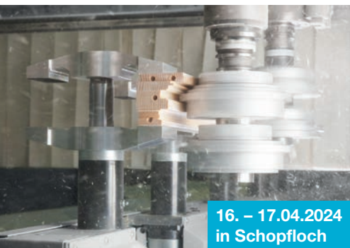
16. – 17.04.2024 in Schopfloch